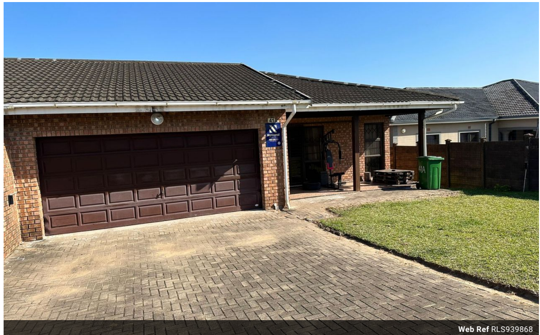
Web Ref RLS939868

Lira Link Rd, Unit 2 Montego Park, Richards Bay Central, Richards Bay, 3900