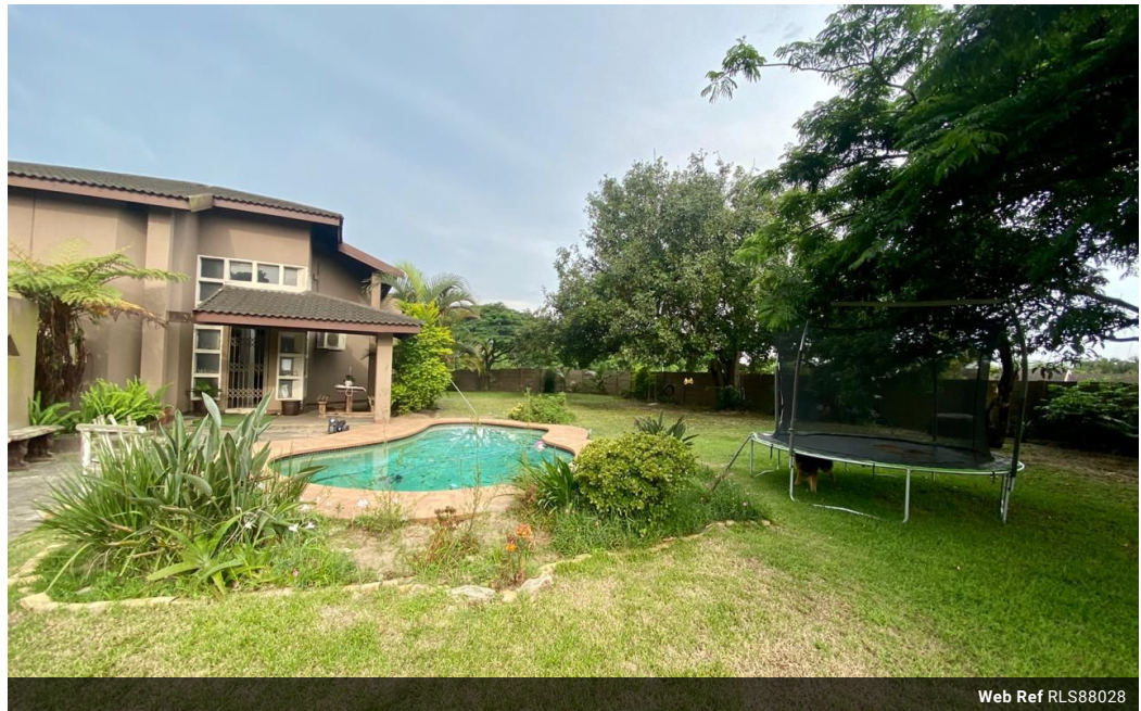
Web Ref RLS88028

Lira Link Rd, Unit 2 Montego Park, Richards Bay Central, Richards Bay, 3900