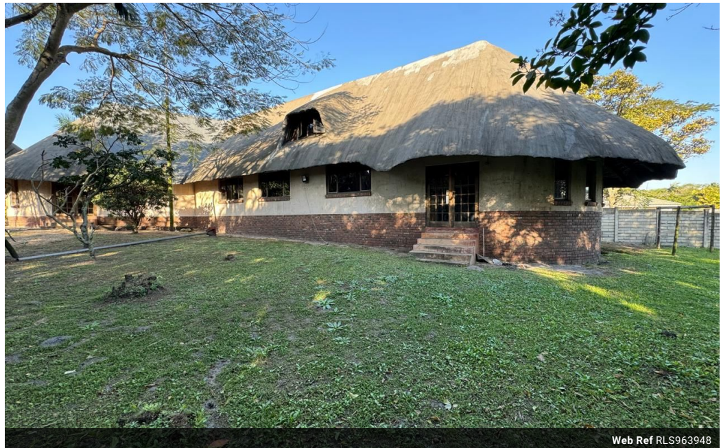
Web Ref RLS963948

Lira Link Rd, Unit 2 Montego Park, Richards Bay Central, Richards Bay, 3900