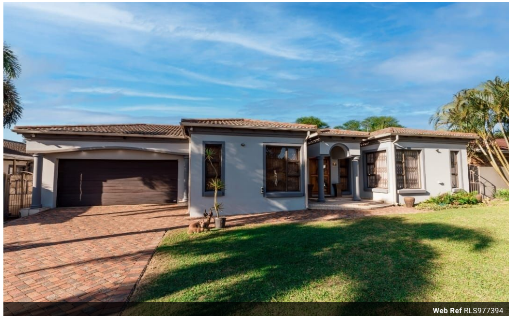
Web Ref RLS977394

Lira Link Rd, Unit 2 Montego Park, Richards Bay Central, Richards Bay, 3900