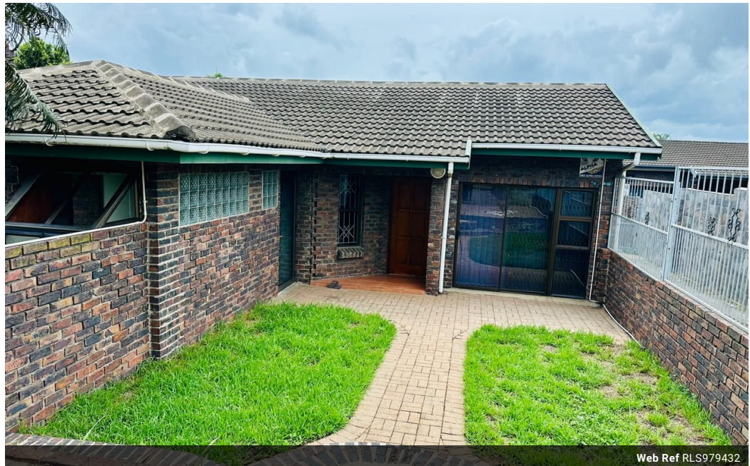
Web Ref RLS979432

Lira Link Rd, Unit 2 Montego Park, Richards Bay Central, Richards Bay, 3900