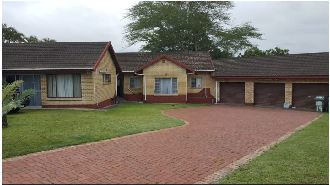
Web Ref 3999717

Lira Link Rd, Unit 2 Montego Park, Richards Bay Central, Richards Bay, 3900