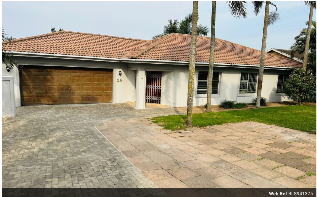
Web Ref RLS941375

Lira Link Rd, Unit 2 Montego Park, Richards Bay Central, Richards Bay, 3900