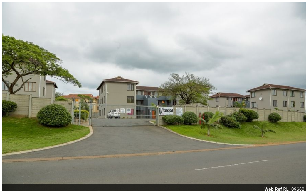
Web Ref RL109660

Lira Link Rd, Unit 2 Montego Park, Richards Bay Central, Richards Bay, 3900