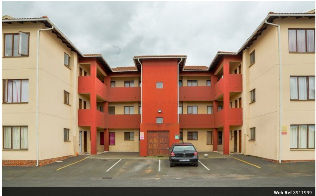
Web Ref 3911999

Lira Link Rd, Unit 2 Montego Park, Richards Bay Central, Richards Bay, 3900