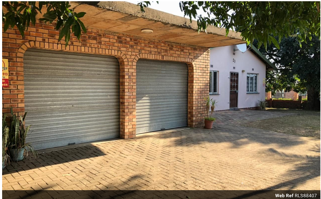
Web Ref RLS88407

Lira Link Rd, Unit 2 Montego Park, Richards Bay Central, Richards Bay, 3900