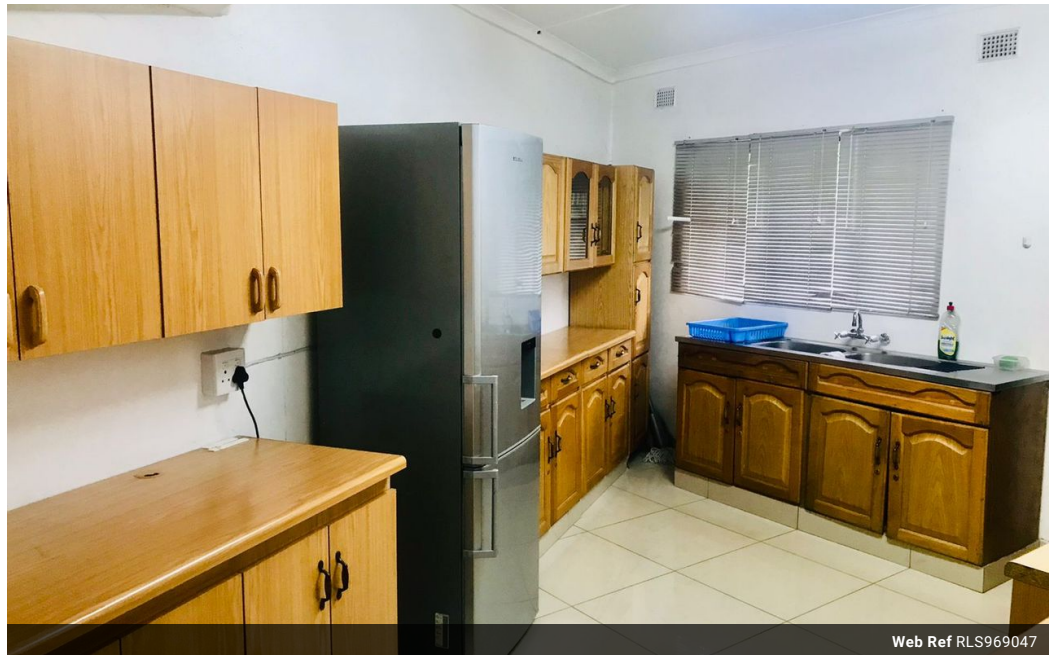
Web Ref RLS969047

Lira Link Rd, Unit 2 Montego Park, Richards Bay Central, Richards Bay, 3900