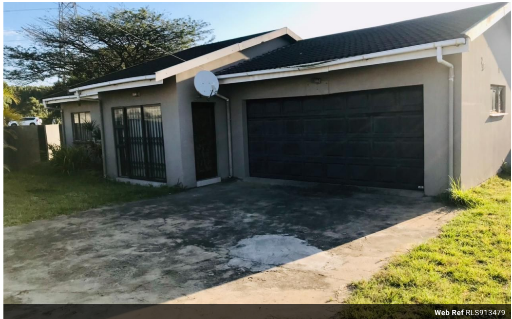
Web Ref RLS913479

Lira Link Rd, Unit 2 Montego Park, Richards Bay Central, Richards Bay, 3900