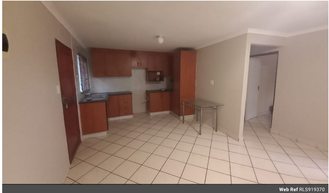
Web Ref RLS919370

Lira Link Rd, Unit 2 Montego Park, Richards Bay Central, Richards Bay, 3900