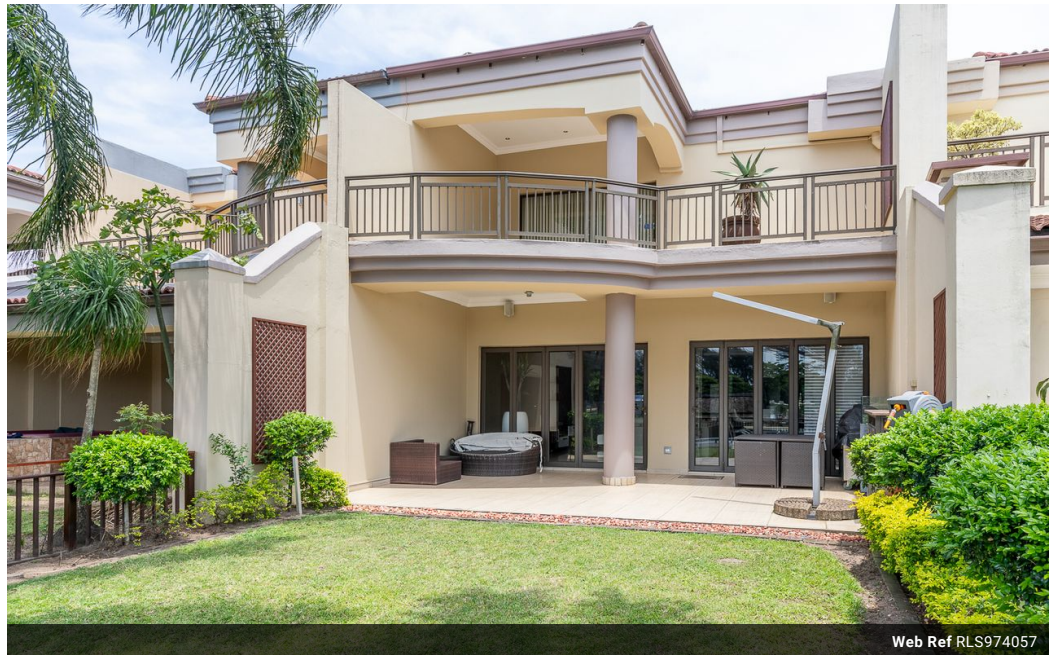
Web Ref RLS974057

Lira Link Rd, Unit 2 Montego Park, Richards Bay Central, Richards Bay, 3900