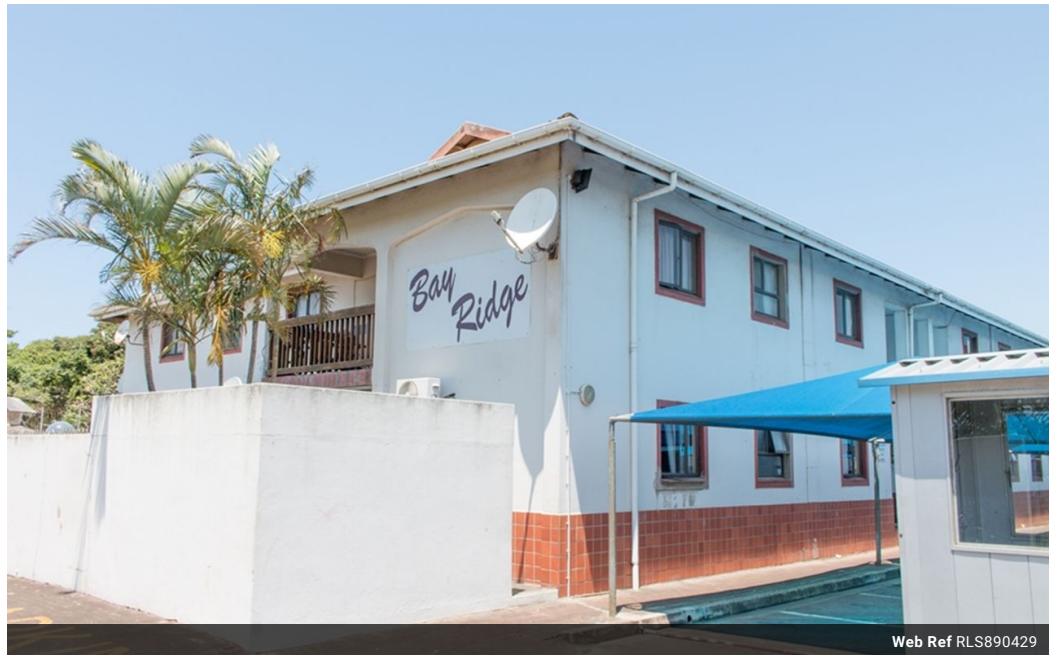
Web Ref RLS890429

Lira Link Rd, Unit 2 Montego Park, Richards Bay Central, Richards Bay, 3900