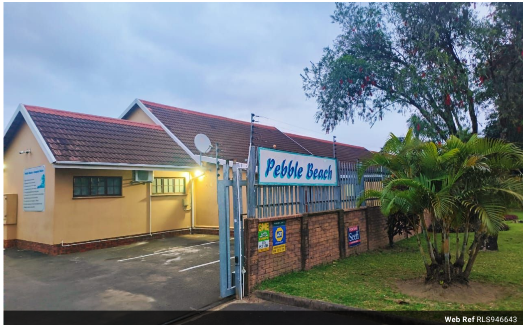
Web Ref RLS946643