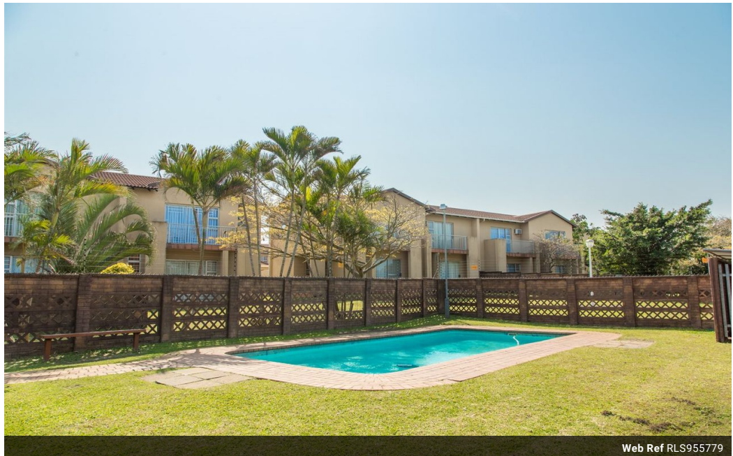
Web Ref RLS955779