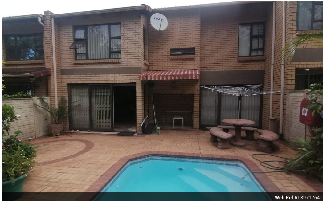
Web Ref RLS971764

Lira Link Rd, Unit 2 Montego Park, Richards Bay Central, Richards Bay, 3900