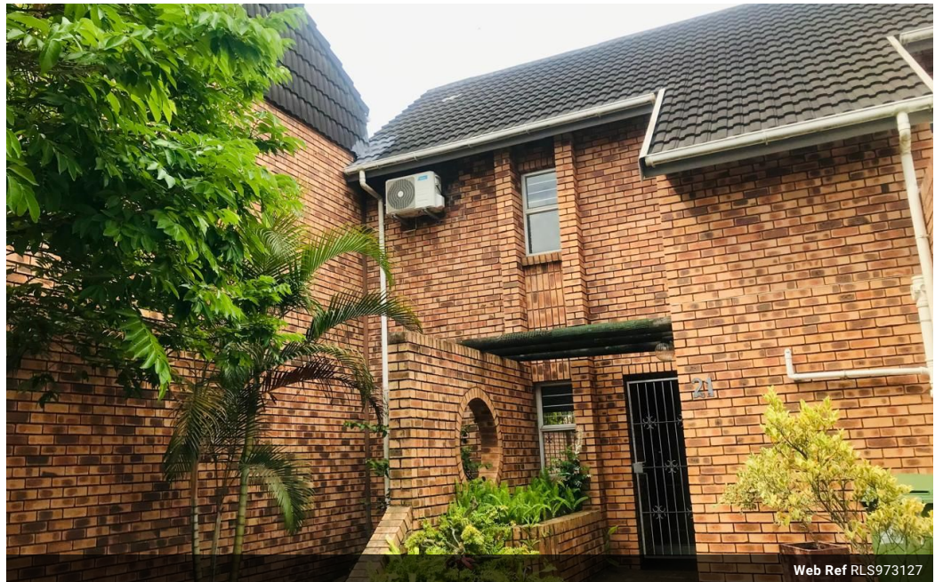
Web Ref RLS973127

Lira Link Rd, Unit 2 Montego Park, Richards Bay Central, Richards Bay, 3900