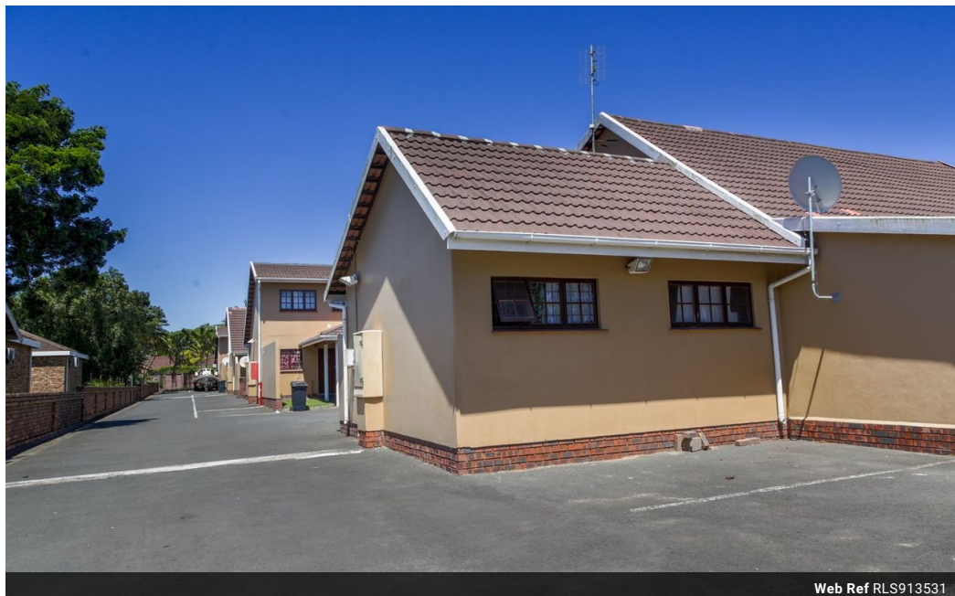
Web Ref RLS913531

Lira Link Rd, Unit 2 Montego Park, Richards Bay Central, Richards Bay, 3900