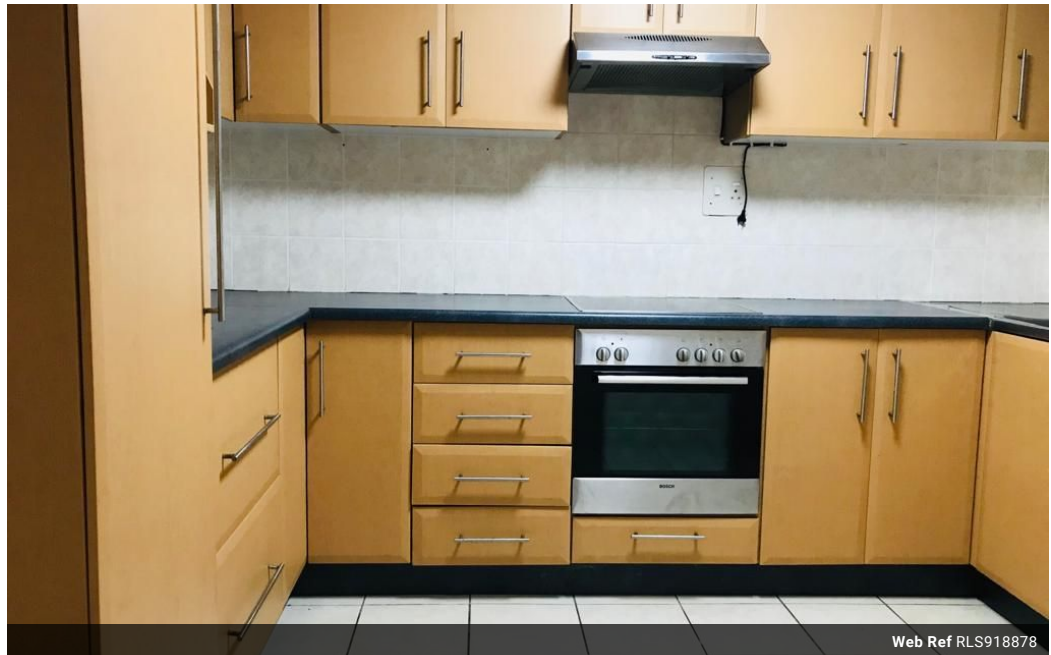
Web Ref RLS918878

Lira Link Rd, Unit 2 Montego Park, Richards Bay Central, Richards Bay, 3900