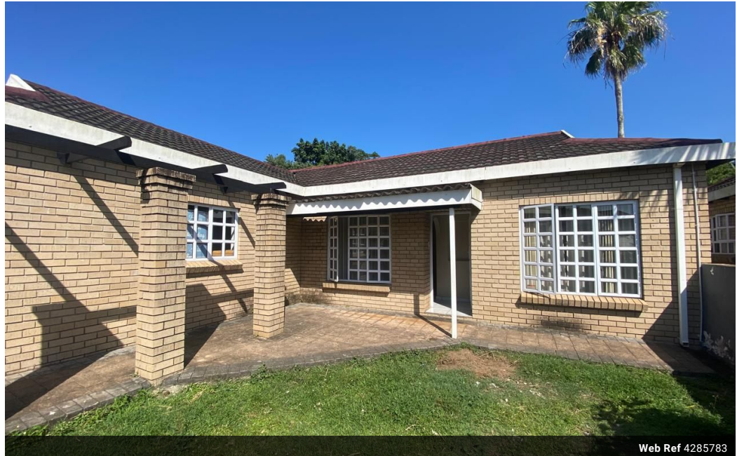
Web Ref 4285783

Lira Link Rd, Unit 2 Montego Park, Richards Bay Central, Richards Bay, 3900