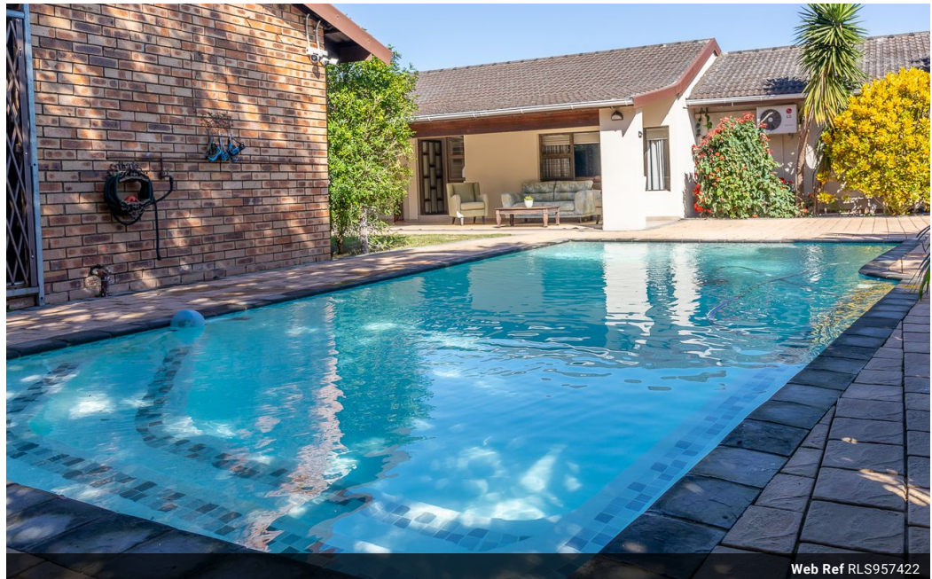
Web Ref RLS957422

Lira Link Rd, Unit 2 Montego Park, Richards Bay Central, Richards Bay, 3900