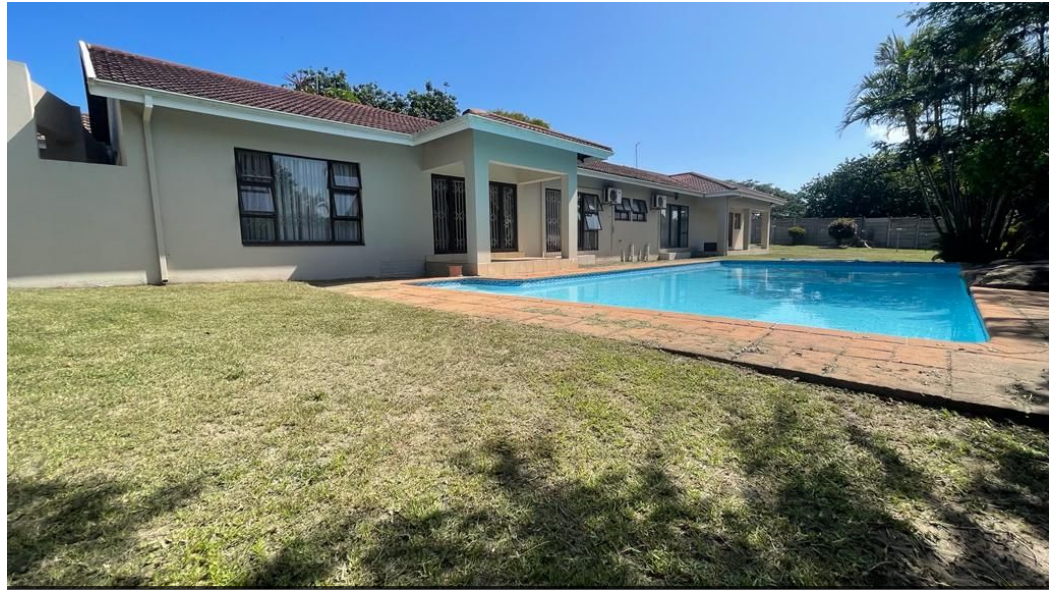
Web Ref RLS977877

Lira Link Rd, Unit 2 Montego Park, Richards Bay Central, Richards Bay, 3900