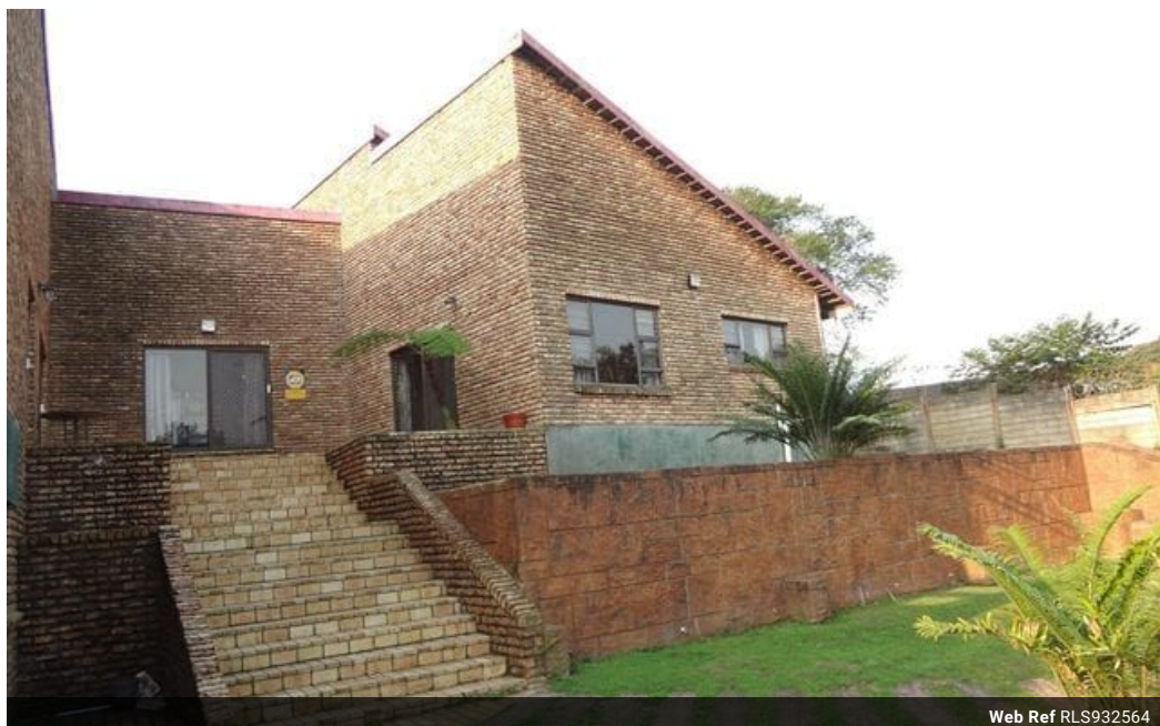
Web Ref RLS932564

Lira Link Rd, Unit 2 Montego Park, Richards Bay Central, Richards Bay, 3900