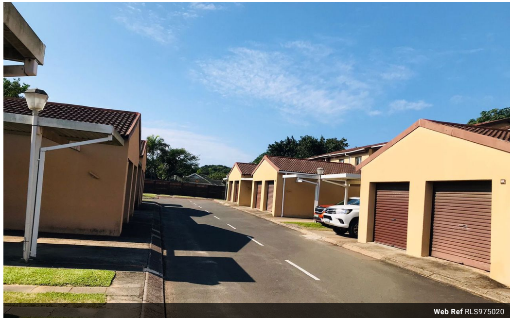
Web Ref RLS975020

Lira Link Rd, Unit 2 Montego Park, Richards Bay Central, Richards Bay, 3900