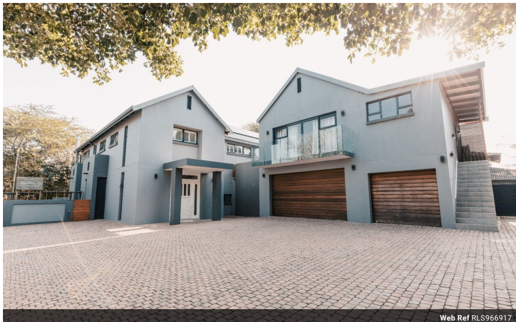
Web Ref RLS966917

Lira Link Rd, Unit 2 Montego Park, Richards Bay Central, Richards Bay, 3900