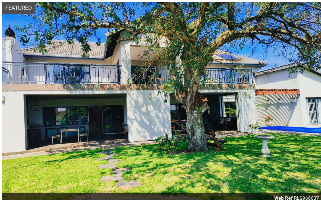
Web Ref RLS968637

Lira Link Rd, Unit 2 Montego Park, Richards Bay Central, Richards Bay, 3900