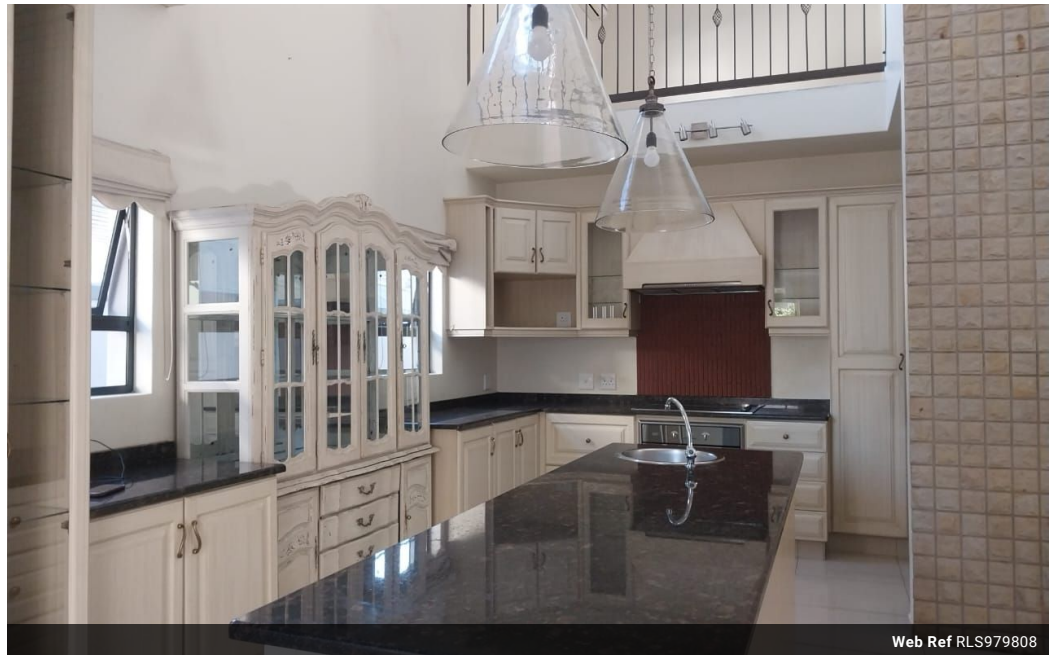
Web Ref RLS979808

Lira Link Rd, Unit 2 Montego Park, Richards Bay Central, Richards Bay, 3900