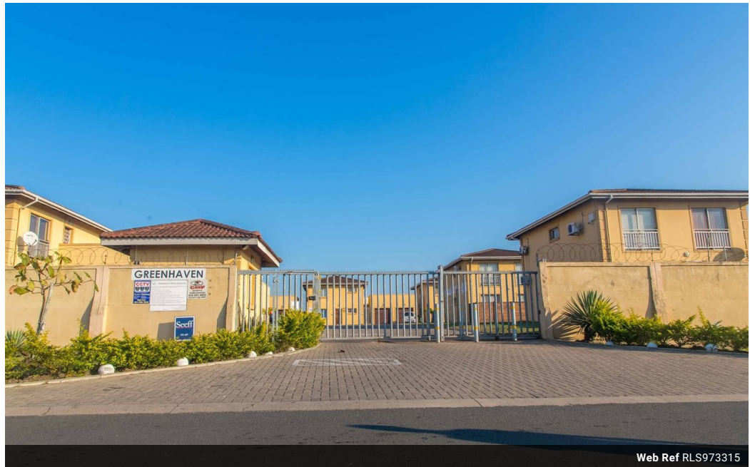
Web Ref RLS973315

Lira Link Rd, Unit 2 Montego Park, Richards Bay Central, Richards Bay, 3900