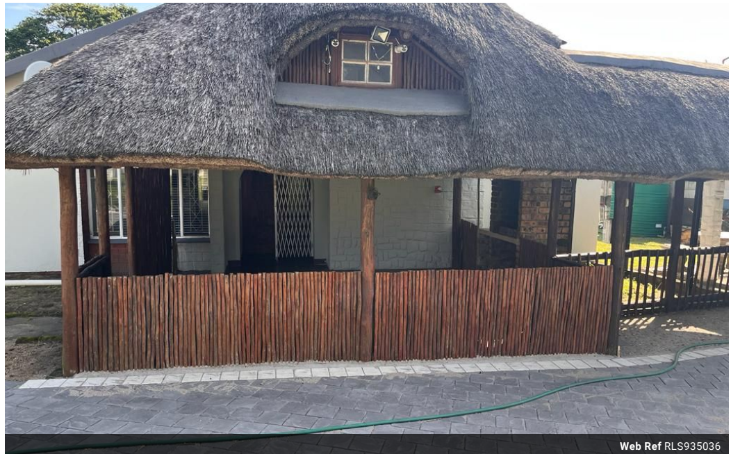
Web Ref RLS935036

Lira Link Rd, Unit 2 Montego Park, Richards Bay Central, Richards Bay, 3900