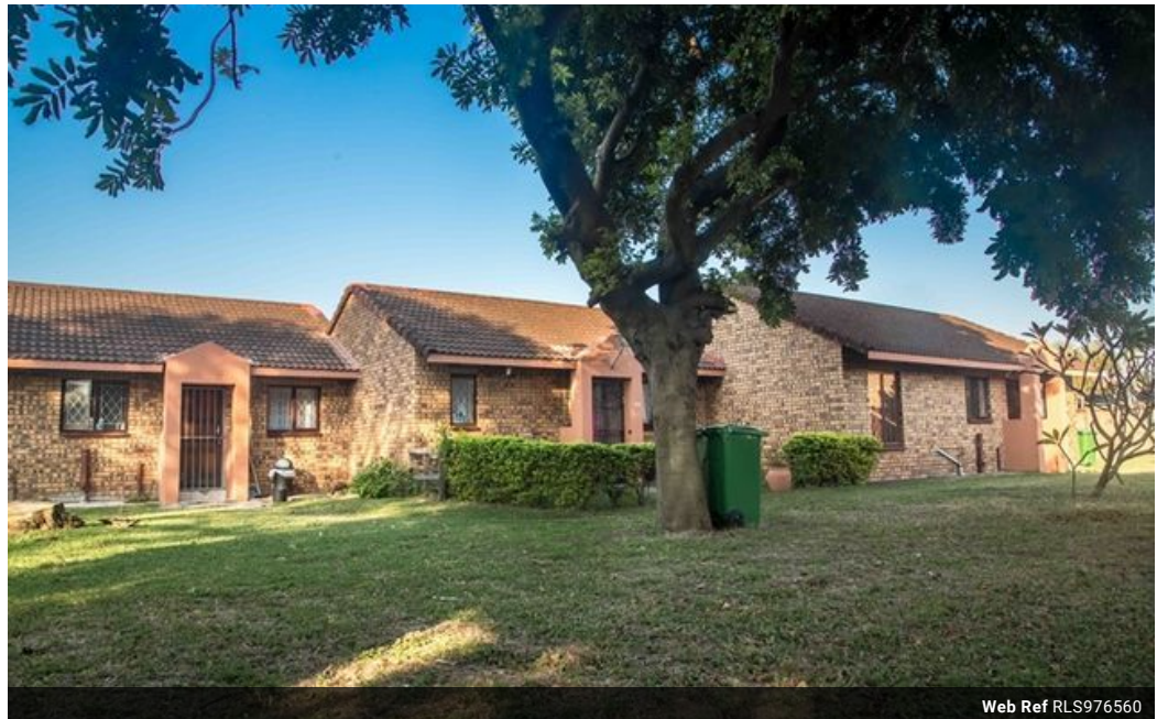
Web Ref RLS976560

Lira Link Rd, Unit 2 Montego Park, Richards Bay Central, Richards Bay, 3900