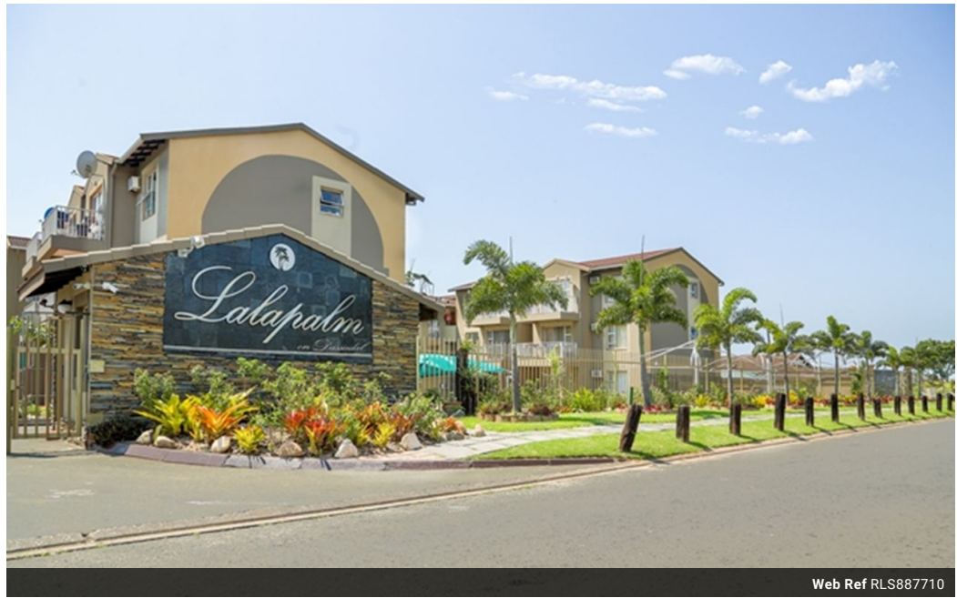
Web Ref RLS887710

Lira Link Rd, Unit 2 Montego Park, Richards Bay Central, Richards Bay, 3900