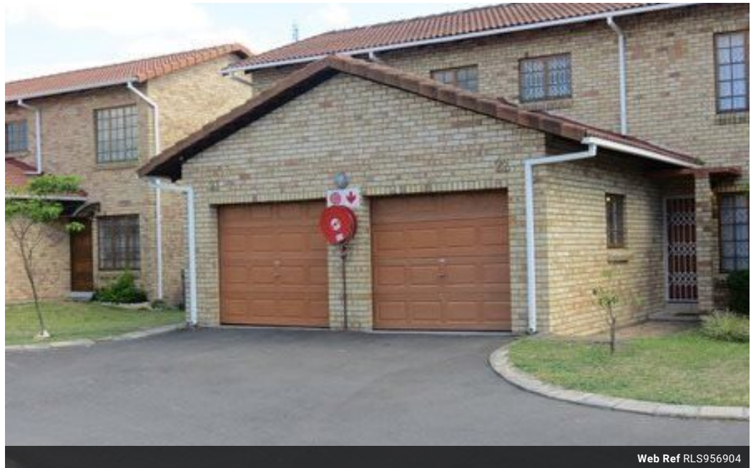
Web Ref RLS956904

Lira Link Rd, Unit 2 Montego Park, Richards Bay Central, Richards Bay, 3900