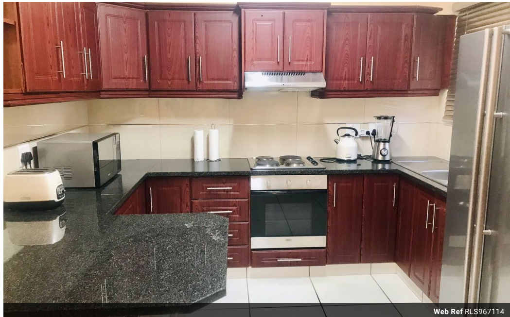
Web Ref RLS967114

Lira Link Rd, Unit 2 Montego Park, Richards Bay Central, Richards Bay, 3900