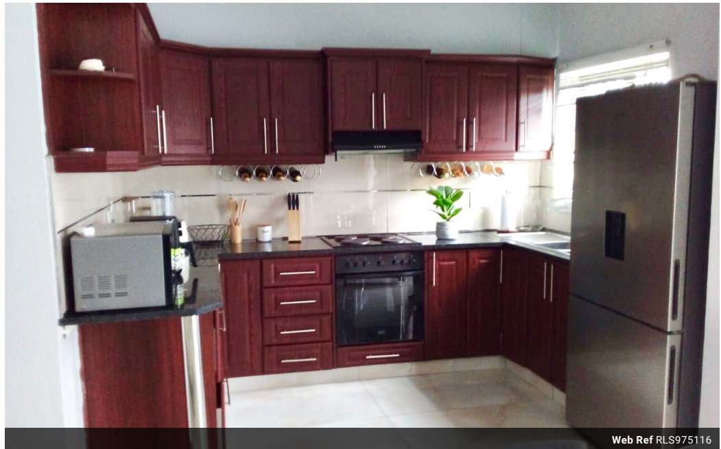
Web Ref RLS975116

Lira Link Rd, Unit 2 Montego Park, Richards Bay Central, Richards Bay, 3900