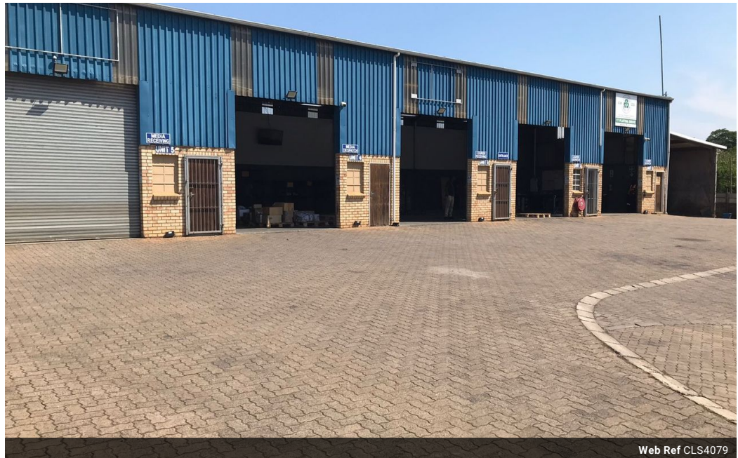
Web Ref CLS4079

Lira Link Rd, Unit 2 Montego Park, Richards Bay Central, Richards Bay, 3900