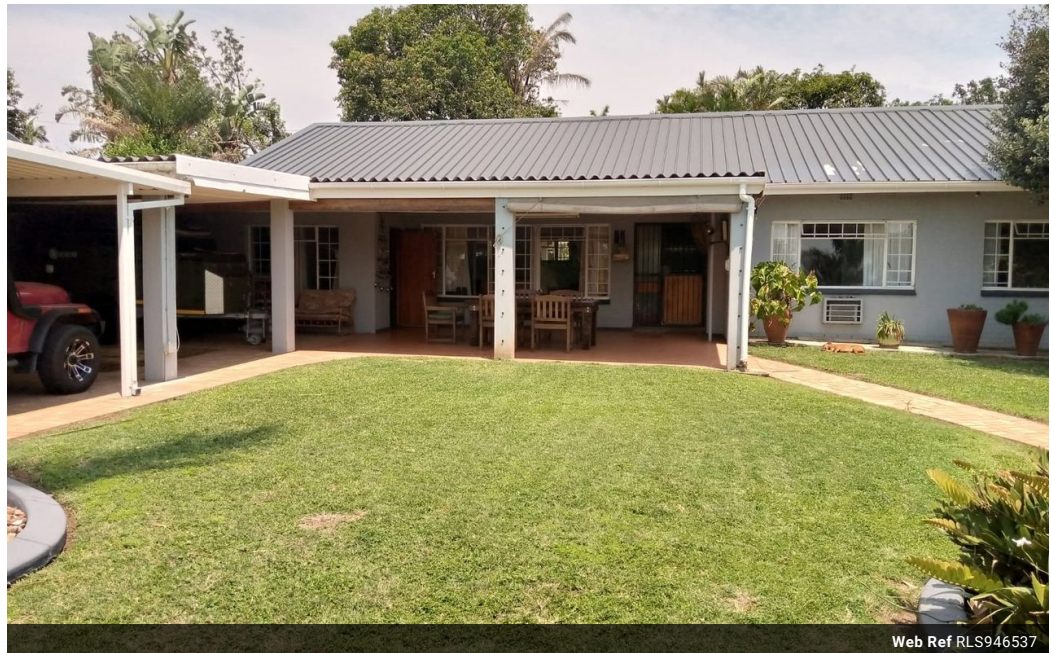
Web Ref RLS946537

Lira Link Rd, Unit 2 Montego Park, Richards Bay Central, Richards Bay, 3900