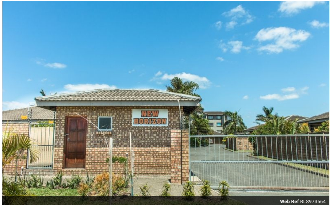
Web Ref RLS973564

Lira Link Rd, Unit 2 Montego Park, Richards Bay Central, Richards Bay, 3900