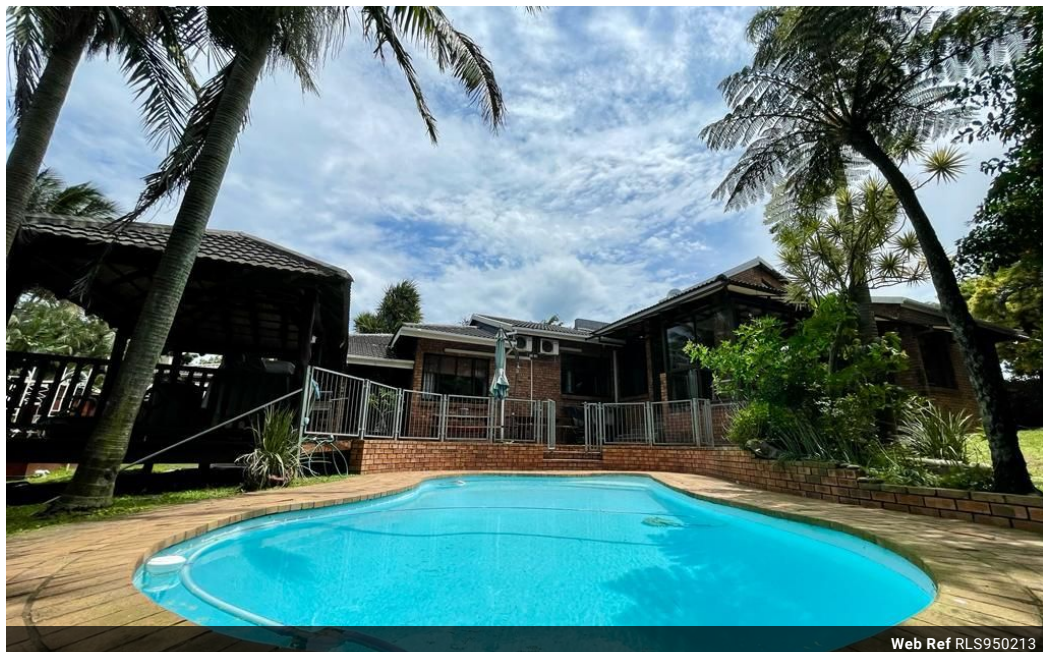
Web Ref RLS950213

Lira Link Rd, Unit 2 Montego Park, Richards Bay Central, Richards Bay, 3900