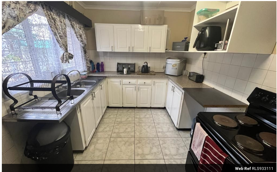
Web Ref RLS933111

Lira Link Rd, Unit 2 Montego Park, Richards Bay Central, Richards Bay, 3900