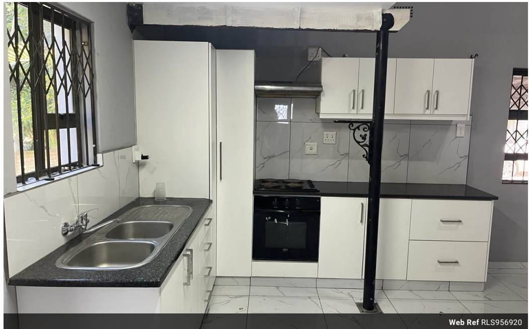
Web Ref RLS956920

Lira Link Rd, Unit 2 Montego Park, Richards Bay Central, Richards Bay, 3900