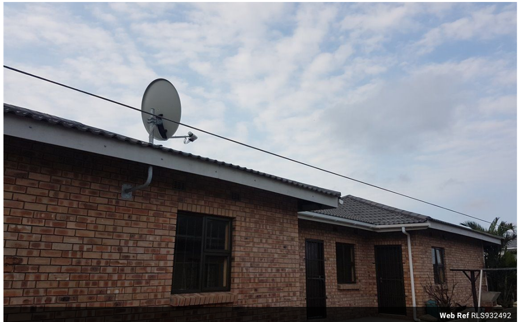
Web Ref RLS932492

Lira Link Rd, Unit 2 Montego Park, Richards Bay Central, Richards Bay, 3900