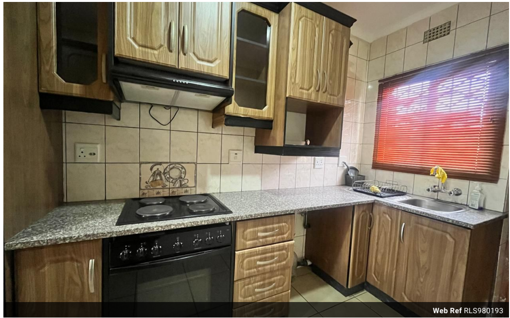
Web Ref RLS980193

Lira Link Rd, Unit 2 Montego Park, Richards Bay Central, Richards Bay, 3900