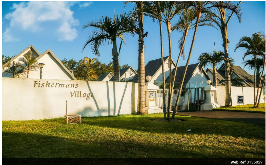
Web Ref 3136029

Lira Link Rd, Unit 2 Montego Park, Richards Bay Central, Richards Bay, 3900