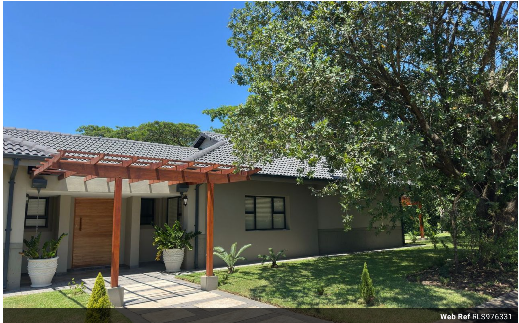
Web Ref RLS976331

Lira Link Rd, Unit 2 Montego Park, Richards Bay Central, Richards Bay, 3900